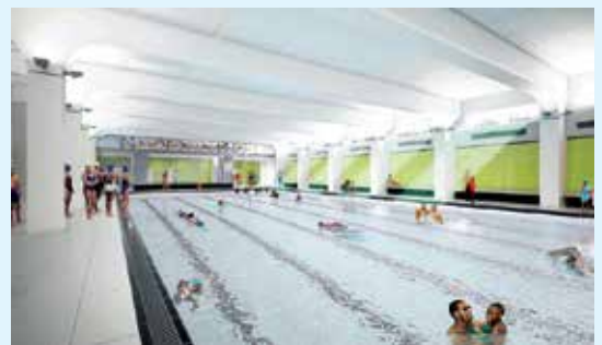
The New Pool

Guildmore Ltd and Tower Hamlets Council carried out extensive consultation campaign at the beginning of the project's development. The council listened to the wishes of the public and it was decided at July's committee meeting that a new learners' pool would be developed at the Poplar Baths site.