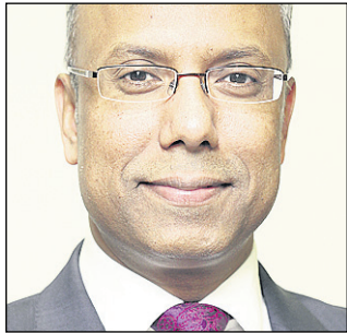
LUTFUR RAHMAN MAYOR OF TOWER HAMLETS

The escalation in violence and killing in Gaza has shocked