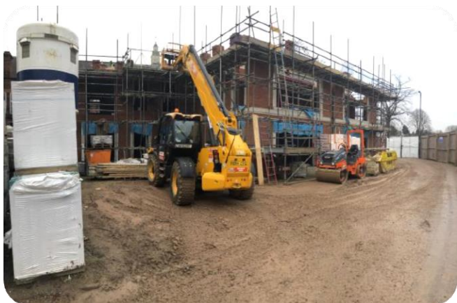
Photo update of Cricketer's House