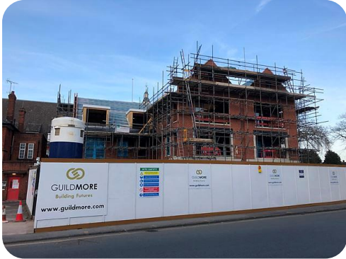
Photo update of Cricketer's House